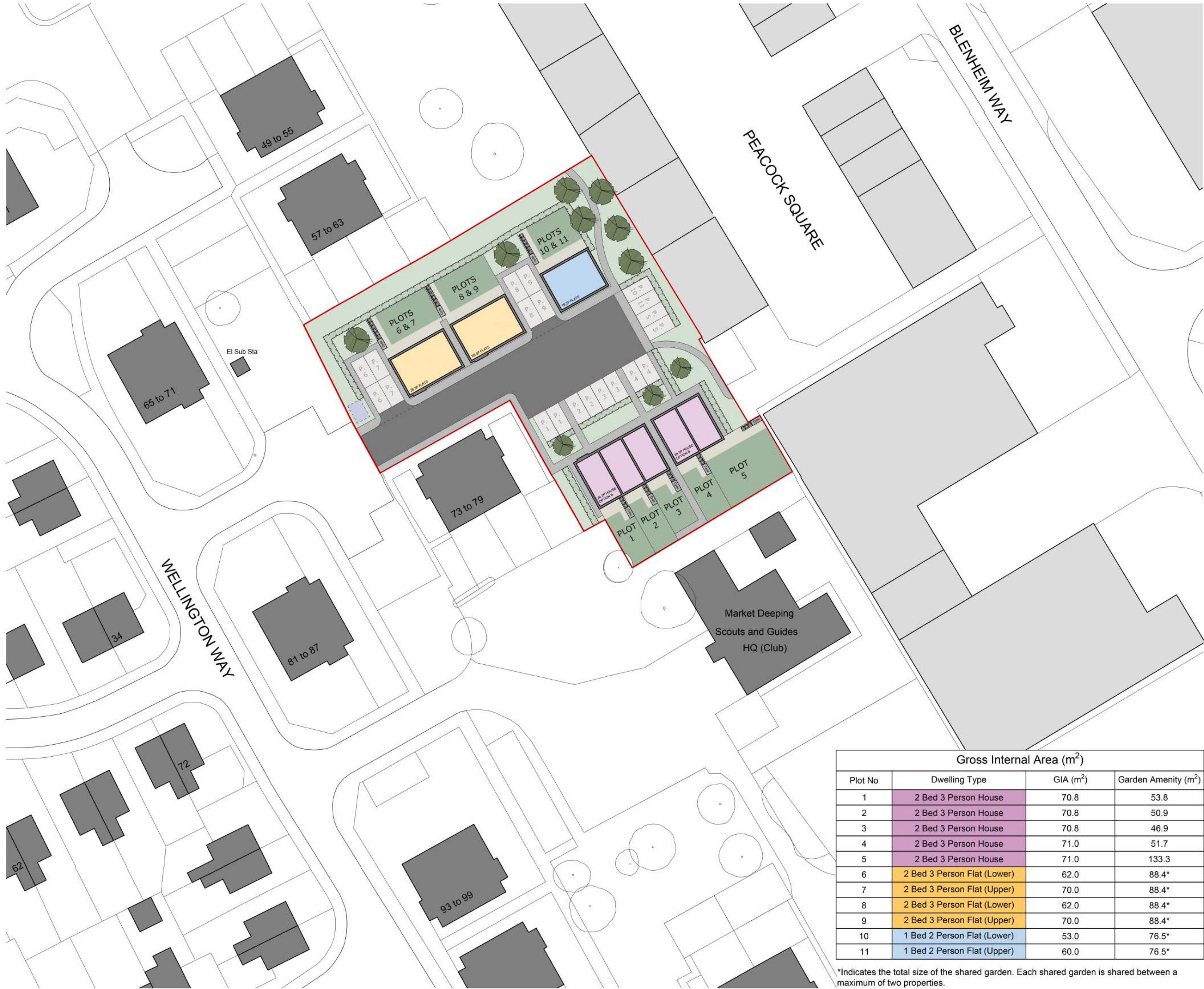
PROPOSED SITE PLAN Scale 1:500